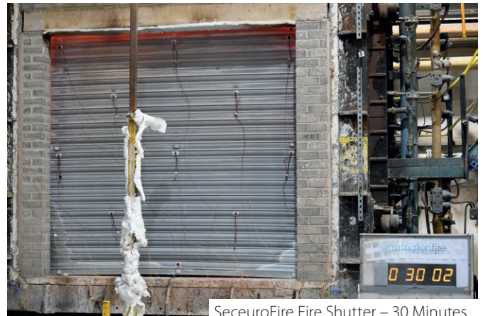
SeceuroFire Fire Shutter – 30 Minutes

The SeceuroFire Fire Shutters were tested and assessed by Warringtonfire. The product is fitted on the furnace side replicating the most severe condition and the temperature of the furnace is increased to 1200°C at a rate defined by the product standards.