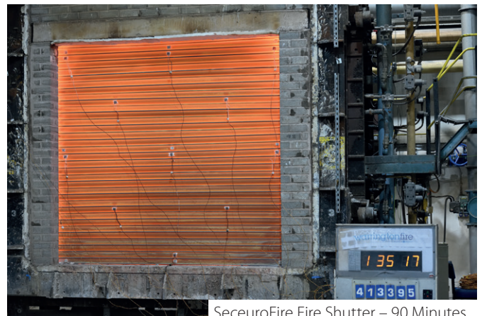
SeceuroFire Fire Shutter – 90 Minutes